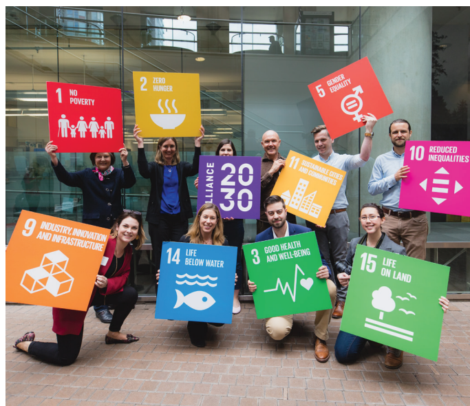
3 Alliance 2030: Canada and the Sustainable Development Goals (SDGs)

After hearing about the forthcoming Alliance 2030 network, participants were asked to discuss how the network could assist with some of the needs, as well as brainstorm what other recommendations would be useful to collectively advance this work.